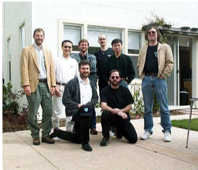
PostgreSQL Core Team, 2000