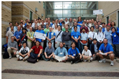
First PostgreSQL Conference, 2006